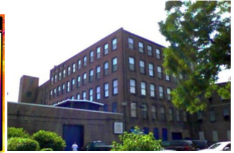
Thermal imaging of the Maryland Center for Veterans Education and Training (MCVET) in Baltimore indicates building heat gain prior to MEA-funded insulation and other upgrades.

With its grant award, HNI was able to improve a total of 27 sites with a range of upgrades including HVAC systems, building envelope improvements, health and safety measures, lighting, appliances and other projects. HVAC and building envelope improvements together accounted for more than half of the total project costs of nearly $1.2 million, followed next by lighting upgrades. Through BGE incentives and the Baltimore Energy Initiative (BEI) , HNI leveraged $408,660 to help cover the cost of several projects.